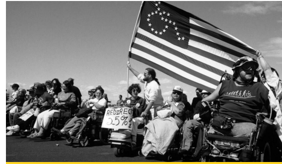
Disability rights activists in 1990